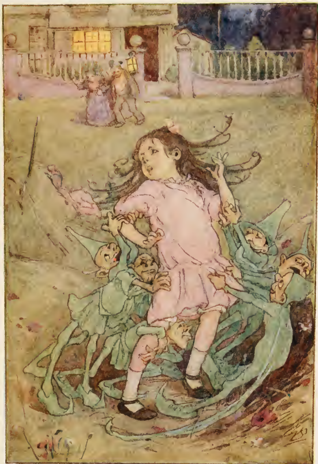
When Amelia heard this she began to shriek for help (p. 158).